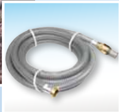
Complete suction set: 7 m (23 ft) hose + strainer + fittings.